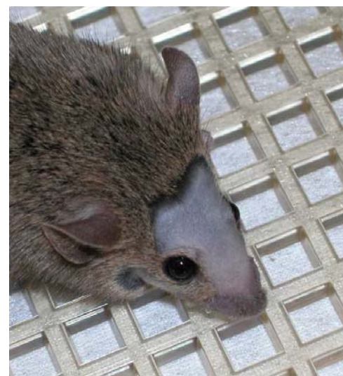
Figure 2. A mouse that has been barbered by a cage mate.